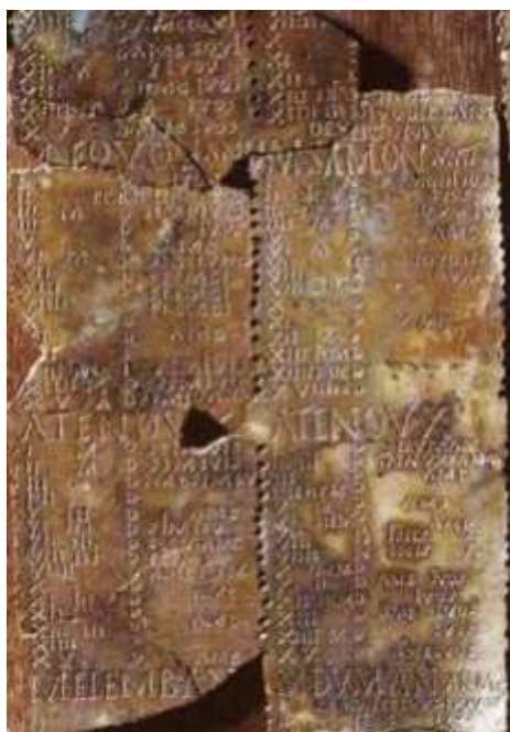
Coligny Calendar: The 1,800-year-old Lunisolar calendar banned by the Romans

The cycle of festivals known by many as the Wheel of the Year – with its solstices, equinoxes, and fire festivals – is not the legacy of a single culture, but a woven tapestry of heritage and tradition. That tapestry stretches far beyond Scotland’s shores. Across Canada, where winter skies blaze with aurora and summer fields