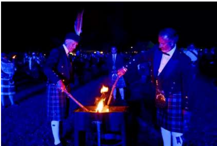
Lighting of the Hearth Flame

June unfurls the year's longest day, and at Callanish, the stones align with the midsummer sunrise to stand in silent testament to ancient astronomy and its reverence for light. The fires that leapt skyward in ancient rites of fertility and abundance, are today revived in the bonfires and hearth flames that light up homes and skies across Scotland and around the world.