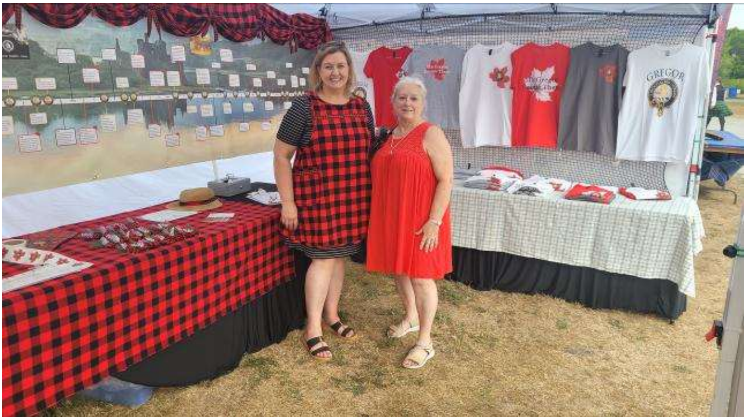
An example of a setup for a booth with timeline banners on two walls and t-shirts on the third.