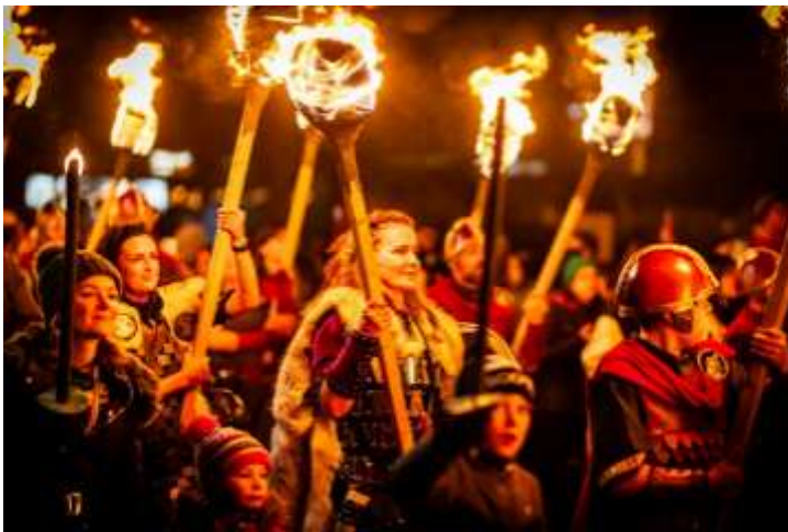
Torchlight Procession Returns

As the cold of December deepens, the sun rides low across the horizon, and the year exhales. In Orkney, the passage tomb of Maeshowe waits for the solstice sunset, its inner chamber glowing with a shaft of light; a Neolithic promise that darkness will not endure. Centuries after its construct, Norse settlers brought their Yule feasts and fire rituals, blending with Celtic midwinter customs.