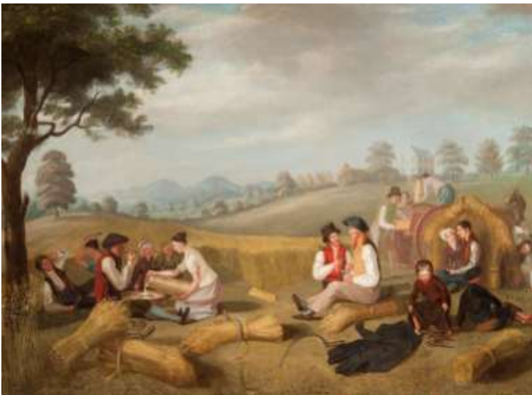
The Autumn Harvest | Image courtesy of National Museums Scotland

By September, the balance between dark and light is returning. Known as Mabon, this equinox marks harvest and harmony – a time to gather both crops and community, to feast, and to give thanks. Norse and Mabon traditions alike wove gratitude into autumn’s fabric, preparing for winter’s long embrace.